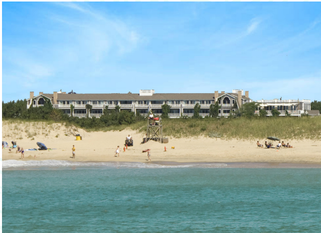
THE WINNETU OCEANSIDE RESORT MARTHA'S VINEYARD, MASSACHUSETTS