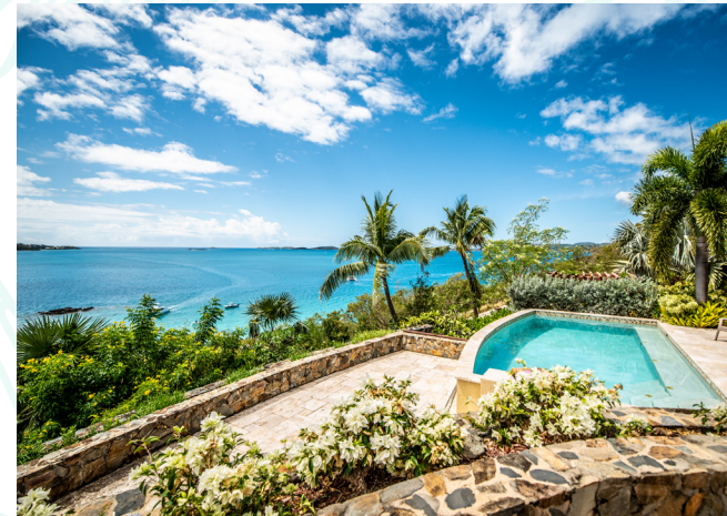
LOVANGO RESORT + BEACH CLUB ST. JOHN, USVI

With the addition of the Lovango Resort and Beach Club, a new boutique hotel brand emerges. Boasting resorts on three sought after islands- Martha's Vineyard, Nantucket, and St John, USVI, Little Gem Resorts represents a welcoming, personal and playful approach to high-end travel. Highly curated but accessible, loyal guests of The Winnetu and The Nantucket Hotel will find the same experience they have come to love in our newest resort, The Lovango Resort and Beach Club.