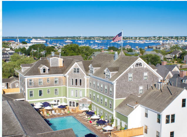
THE NANTUCKET HOTEL + RESORT NANTUCKET, MASSACHUSETTS