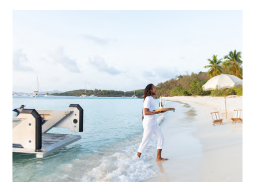
Resort Ferry to Honeymoon Beach