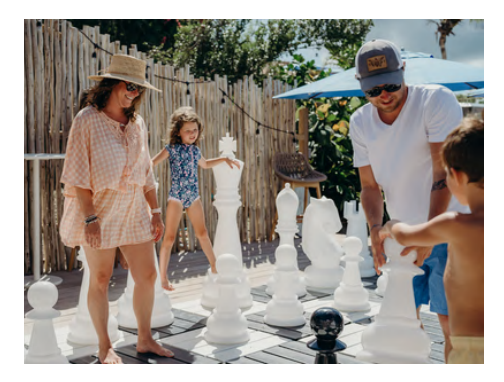
Complimentary Children's Program