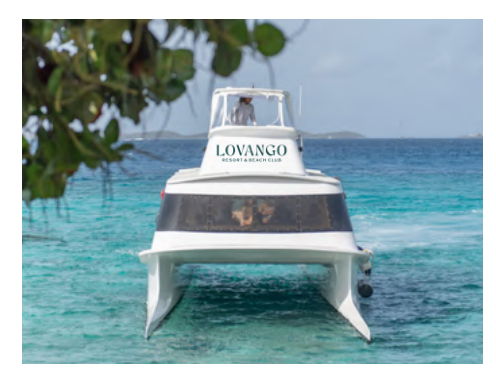
Resort Ferry to STT ど STJ