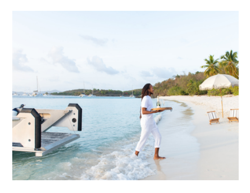
Resort Ferry to Honeymoon Beach