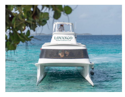
Resort Ferry to STT ど STJ