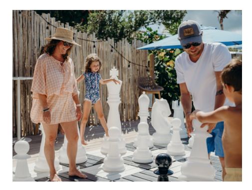
Complimentary Children's Program